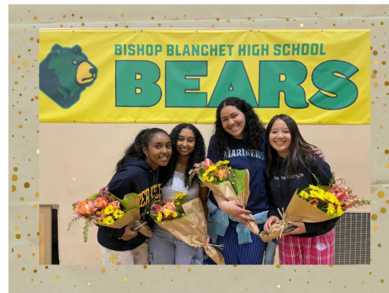
And a special thank you to our graduating seniors!